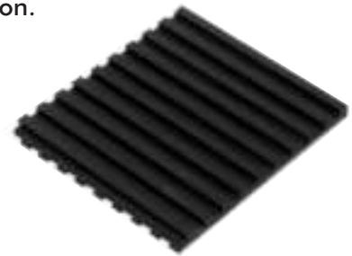
Ribbed Mounting Pads