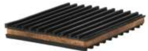
Cork Sandwich Pads